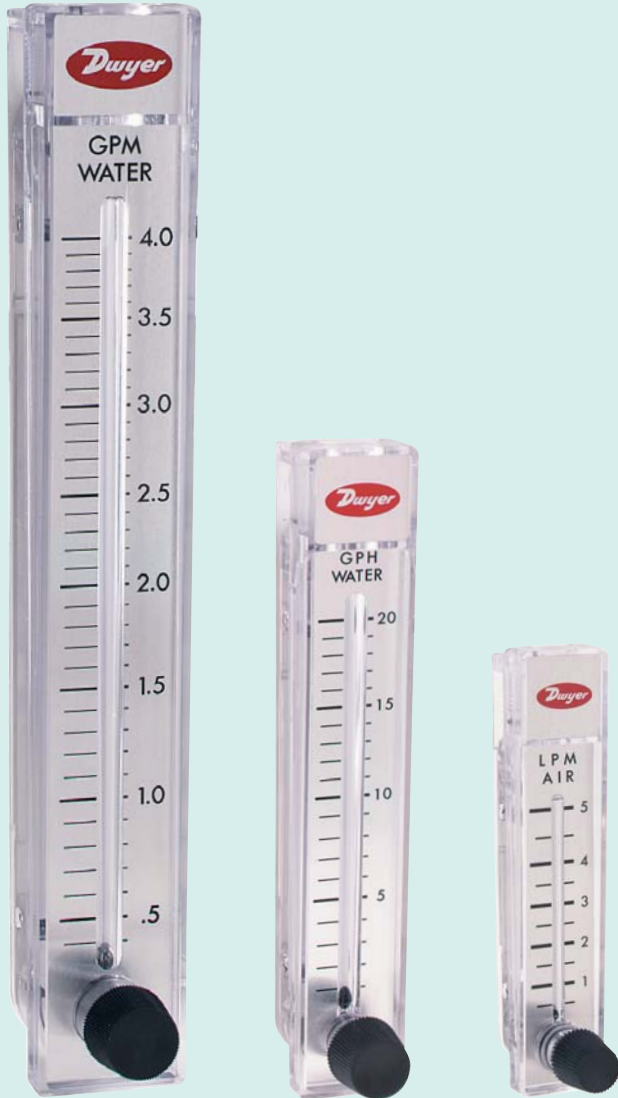
Model RMC-SSV10® scale, 15" high